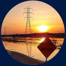
FLOODING & RAIN DAMAGE