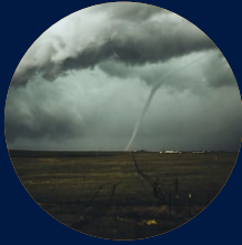
TORNADOS & STORMS