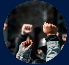
PROTESTS & UNREST