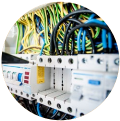
LOSS OF SYSTEMS